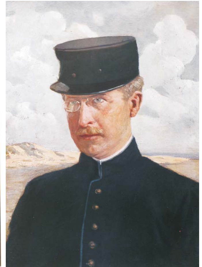
Painting of King Albert I in 1916

KCC has now relocated it to The Grand, and is seeking EU funds to execute a restoration under the public gaze. Belgian visitors have commented on the likeness of the Belgian Vice-Consul's similarity to King Albert I of the Belgians, and lately a portrait of the King by the same artist at the same date indicates that indeed it is he; the explanation would seem to be that it was politically inappropriate to show the king in his finery apparently having reached a safe haven before his subjects!