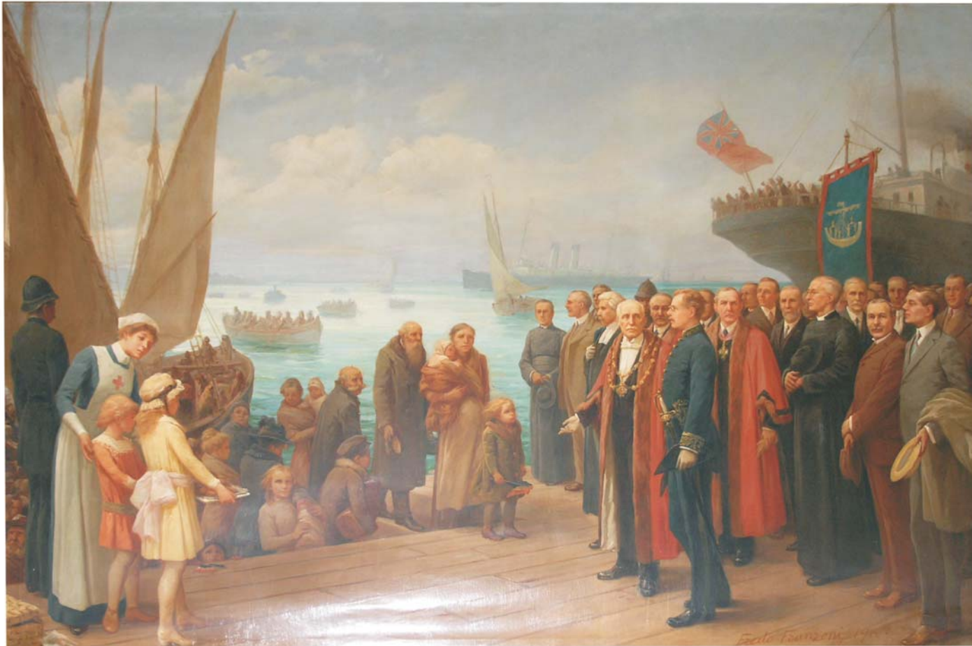
Painting donated to Folkestone in 1916