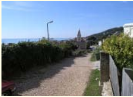
Lane below to Arnold House