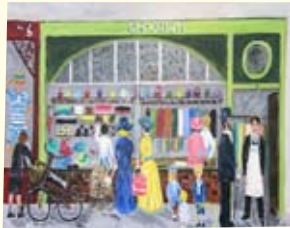
Kipps at work £80 Yvonne Hutchcraft